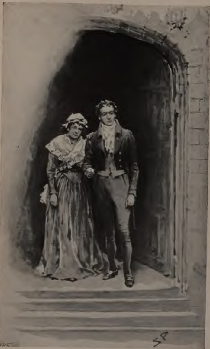
A woman stood beside him.